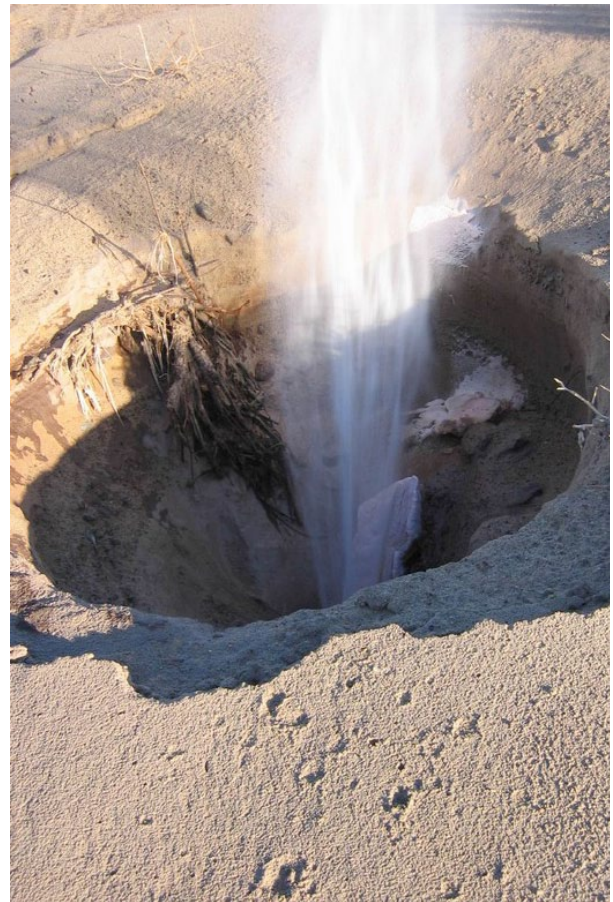
A Kinder Morgan oil pipeline ruptures in endangered species habitat in California's Mojave Desert.