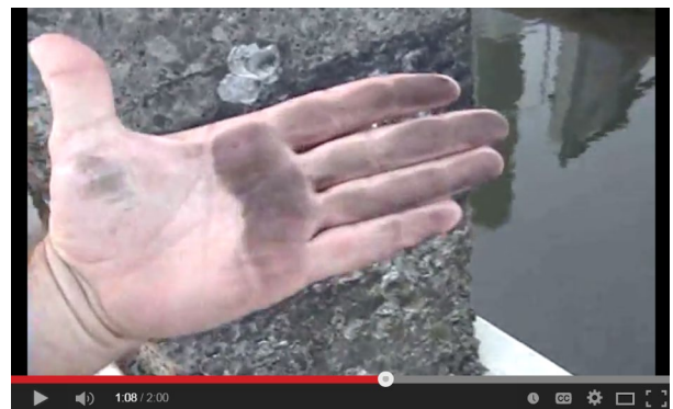
Coal dust from Kinder Morgan's coal terminal contaminates a piling at the Cooper River Marina in Charleston, South Carolina.