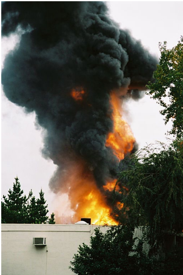
A ruptured Kinder Morgan pipeline in Walnut Creek, California, killed five people when it exploded.

In November 2004, an oil pipeline owned by a Kinder Morgan subsidiary burst in the Mojave Desert, sending a jet of fuel 80 feet into the air. The break closed the nearby interstate highway and contaminated more than 10,000 tons of soil in the habitat for federally-designated endangered species. 70