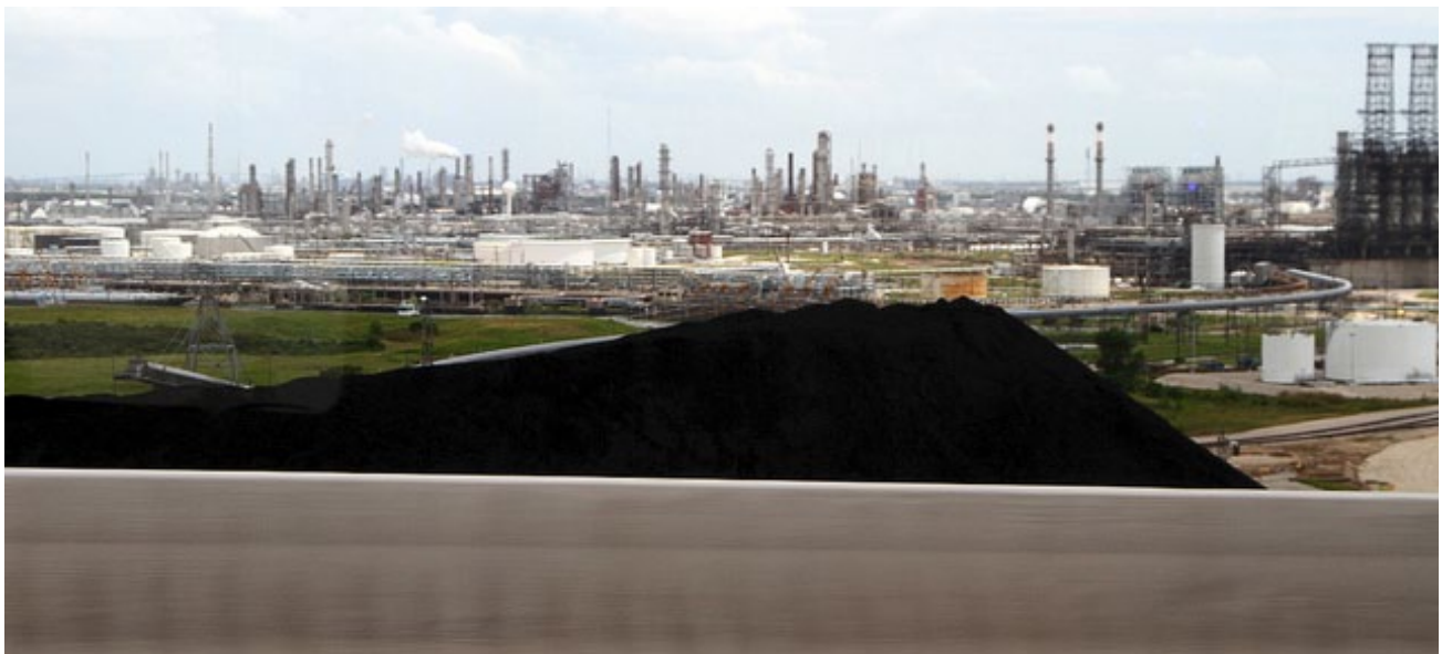
Kinder Morgan’s coal piles rise above Houston’s Beltway 8 Bridge.

Although the source of pollution cannot be definitively proven, there are reasons to think that it may have originated at the coal and petcoke piles at Kinder Morgan’s facilities, which sometimes reach as high as the nearby freeway and reportedly coat passing vehicles with black dust on a regular basis. 28 In fact, a range of public interest organizations have raised concerns about both terminals, arguing that their draft permits allow them to emit 32 tons of hazardous particulate matter at Penn City and 16 tons at the Deepwater Terminal. 29